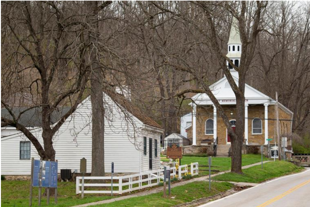
Grant's birthplace in Point Pleasant, Ohio