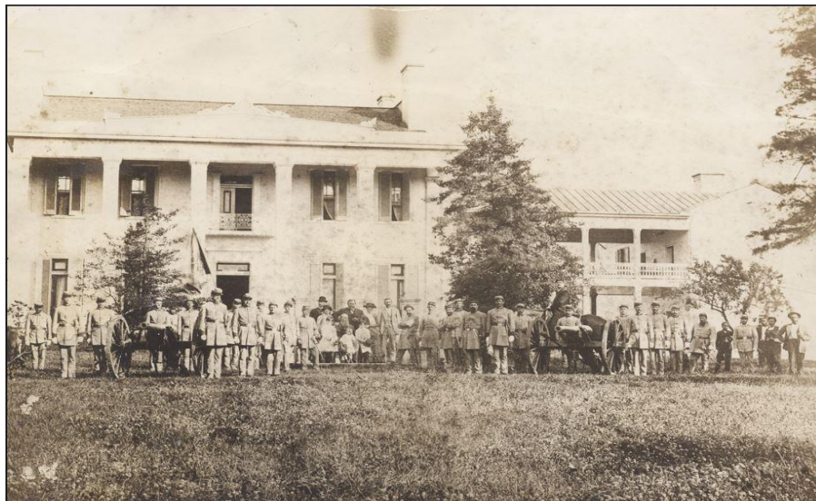
The Harding Artillery