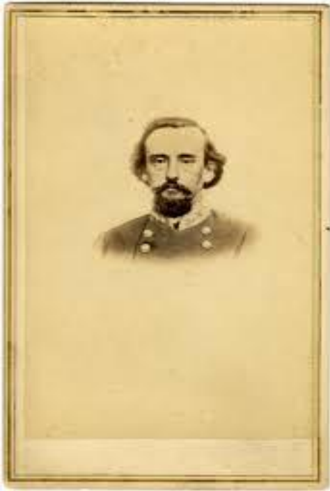
Gen James R. Chalmers