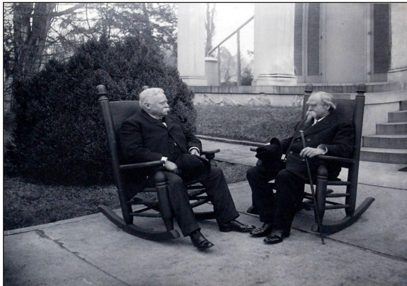
Fitzhugh Lee and William Hicks Jackson