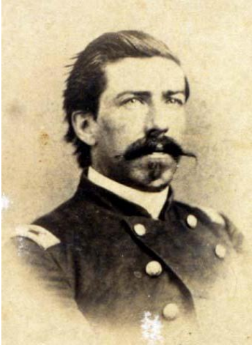
General George Spalding, 12 th Tennessee Cavalry

clothing, forage, and even a safe, along with roughly 43 Confederate soldiers near the mansion and the plantation.